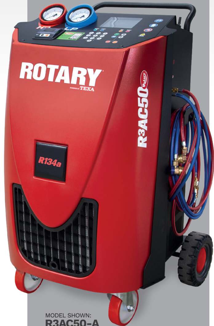
MODEL SHOWN: R3AC50-A SHOWN WITH OPTIONAL THERMAL PRINTER.

WATCH AND LEARN! Scan code to watch product demo videos.