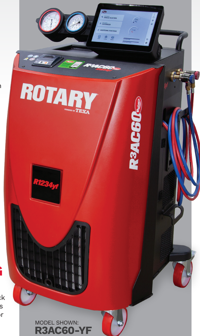
MODEL SHOWN: R3AC60-YF SHOWN WITH OPTIONAL THERMAL PRINTER.

WATCH AND LEARN! Scan code to watch product demo videos.